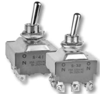
Changes for S30 & S40 Toggles

I. The location of production will change from the Japan factory to the Philippines factory for S30s and S40s S Series Toggles. The place of manufacture will no longer appear on the switches, and the logo will be updated. The lot number on the switch case will have a dot mark above the second digit, and the box in which the switches are packaged for shipping will read "PHILIPPINES FACTORY" instead of "JAPAN FACTORY." All of these revisions will apply to standard and custom products. Effected standard part numbers are listed below.